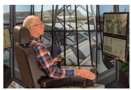
Interactive training simulator